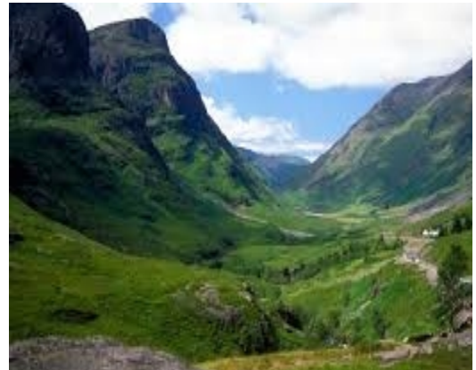
The Eastern Highlands

On behalf of the ZACB local Organising Committee, I look forward to sharing this historic and indeed great 4 th AFCC Congress 2015 in the sunny, “smiling” and peaceful city of Harare, Zimbabwe.