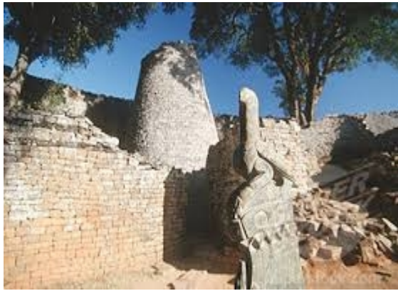
Great Zimbabwe: UNESCO World Heritage Site

delegates and visitors an opportunity to experience the abundant natural wild life and an exciting African experience to remember for a life time.