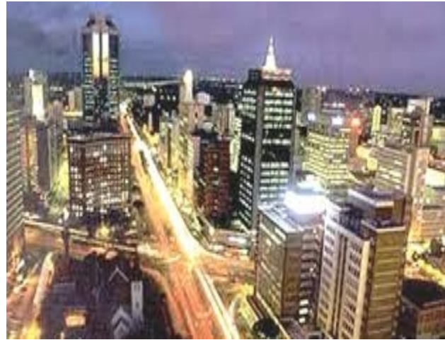
The beauty of Harare

The Zimbabwe Association of Clinical Biochemistry and Laboratory Medicine (ZACB) is ready and greatly honoured to host the historic 4 th African Federation of Clinical Chemistry and Laboratory Medicine Congress at the Rainbow Towers, the Harare International Conference Centre in Harare from 25-30 th April 2015. Harare is the capital city of Zimbabwe known as the “Sunshine City” of highly educated, skilled, peaceful and welcoming 1.5 million inhabitants. It is a cosmopolitan city with 5 universities, the oldest being the University of Zimbabwe celebrating 60 years of its existence and the growth of Clinical Laboratory Medicine this year.