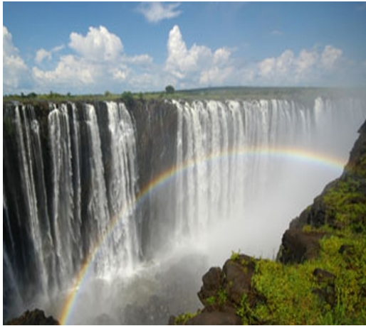
The mighty majestic Victoria Falls